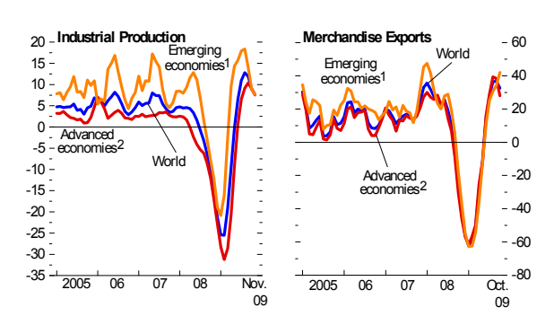
Figure 2. Selected High-Frequency Indicators (Annualized percent change of 3-month moving average over previous 3-month moving average unless otherwise noted)

Sources: Haver Analytics; and IMF staff calculations.