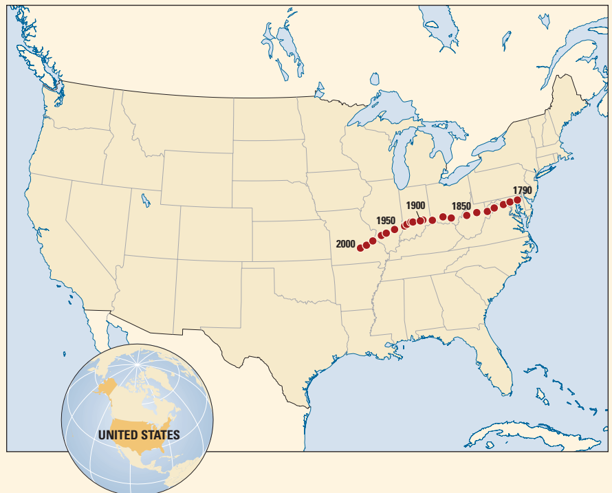
Map G1.1 The U.S. geographic center of population gravity moved 1,371 kilometers between 1790 and 2000