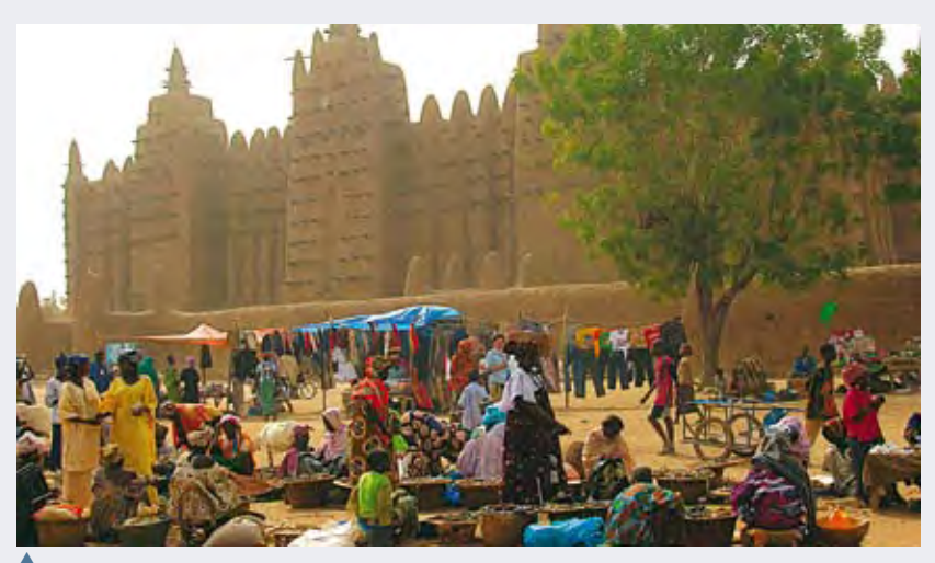
The Grand Mosque in Djenne in Mali.

But how does one measure a city's soul? One way is to measure its level of "liveability". Surveys that determine a city's "liveability use indicators such as air quality, affordability, public transport and