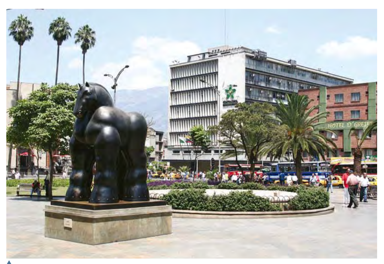
Bogota main square