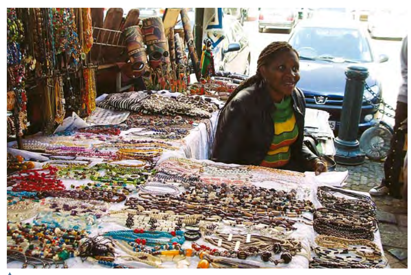
A trader in South Africa

Inauthentic or ineffective participation has happened particularly in places where rising urban land values and