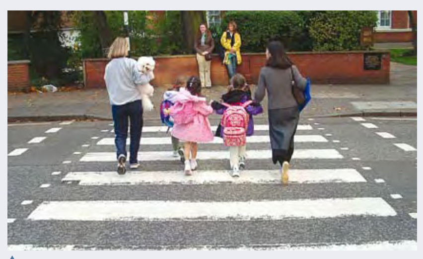
Women and children crossing a road in London

lows for the classification of cities according to six indicators: kindergarten coverage for children; percentage of female municipal council members; education levels of women and men; number of women per 100 men aged 20 to 39; labour force participation of women and men; and incomes of men and women.