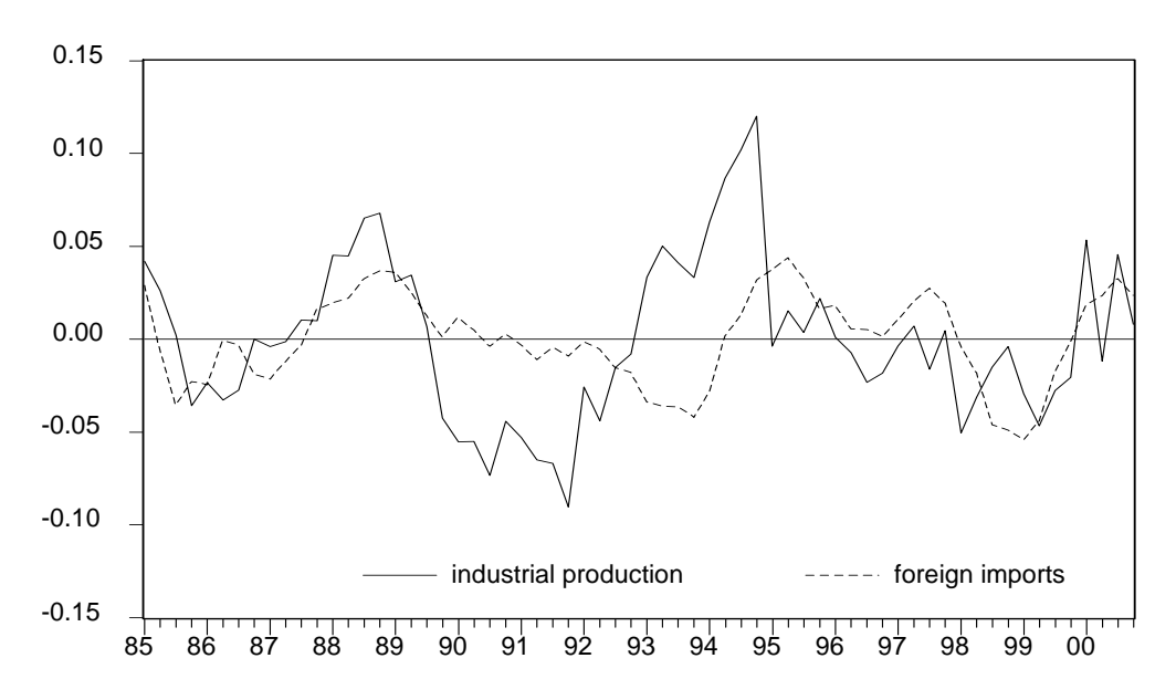
Figure 1 Cyclical components of foreign imports and domestic industrial production

To assess the correlation between China's business cycles and those of its trading partners, the cyclical components of the constructed import index and China's industrial production are plotted in Figure 1.9 Fluctuations in the foreign import series are of smaller amplitude than those in domestic industrial production. This is not surprising given that the former is essentially the average of a number of unsynchronized series. The figure also suggests that the conformity of China's business cycles with international cycles has varied over time. In the first half of the 1990s, domestic industrial production evolved quite independently; the other years saw some concordance between the two series. Accordingly, their contemporaneous correlation coefficient changed from 0.56 for 1985–90 to 0.05 for 1991–96 to 0.57 for 1997–2000.