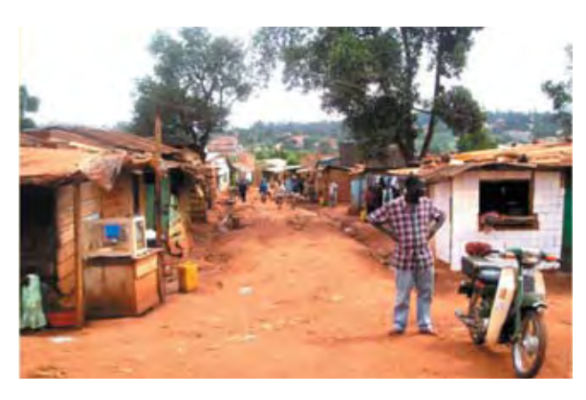
Un tarmacked road through a slum.

better to tarmac a road kilometre by kilometre even if it takes 5 years, using the resources currently availed for maintenance annually. Other socio-economic factors such as education, health, electricity, communication, finance and credit are also discussed and positioned in the upgrading agenda. Gender and HIV/AIDS are also crucial cross-cutting issues within the context of persistent systemic socio-cultural barriers that operate to deny women and other socially marginalized groups their full rights of access to and control over resources especially land and housing which are key in slum upgrading.