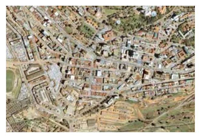
Kampala city centre.

Kampala is both the administrative and commercial capital city of Uganda situated on about 24 low hills that are surrounded by wetland valleys, characterized by an imprint of scattered unplanned settlements. This urban form is attributed to the dualism, which arose between the local Kibuga and Kampala Township or Municipality. The former was largely unplanned and unsanitary while the latter was fully planned and highly controlled. The emergency of slums in Kampala City has been gradual and sustained over a long period of time. It is attributed to the failure of Kampala Structure Plans to cater for the growth and development of African neighbours. Other factors that have contributed to this growth include: the rapid urban population growth, which has overwhelmed city authorities; land tenure systems which are complicated and multiple, together with poverty and low incomes amongst the urban population.