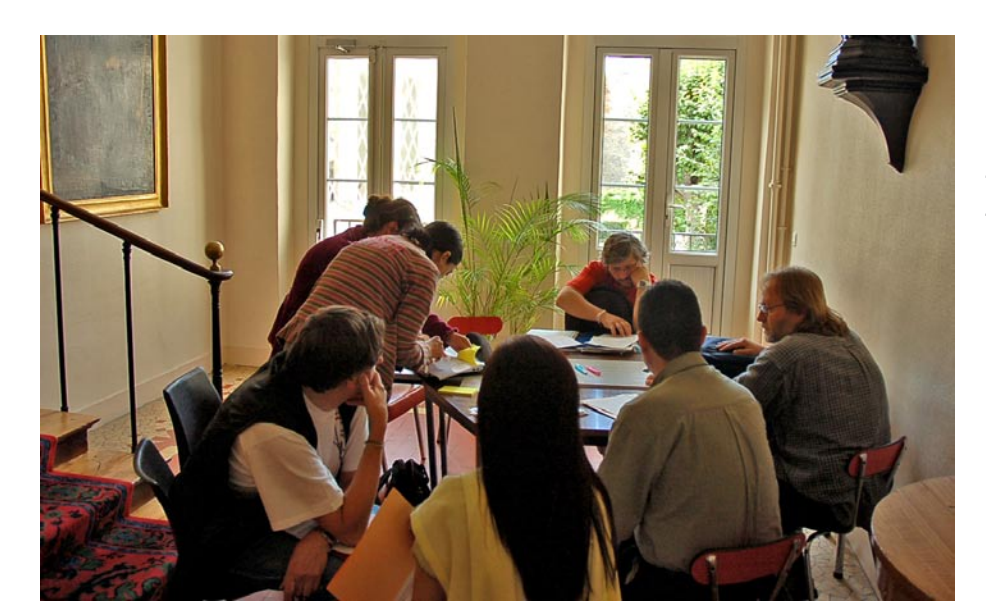
ExCom Decisions Executive Committee meeting in preparation for the AGM in Paris.