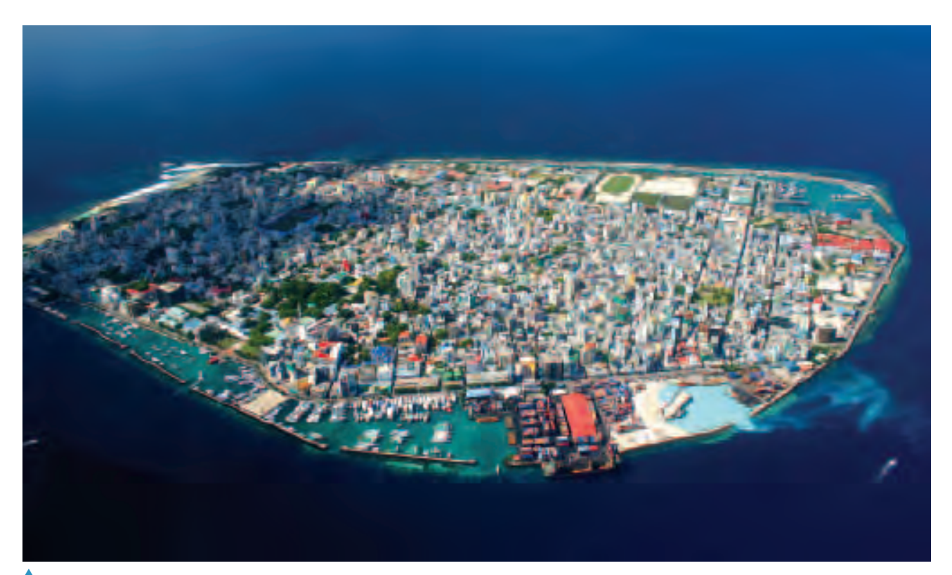
Malé, Maldives.