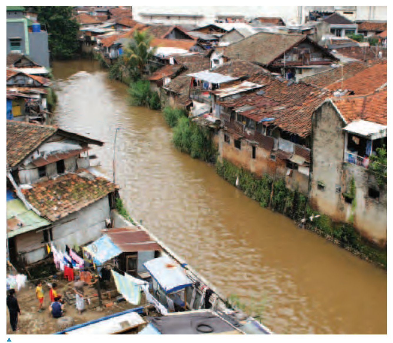
Slum area in Bandung, West Java Province, Indonesia.

friendly environments to attract domestic and foreign direct investment in order to facilitate urban-led economic growth. Fiscal and regulatory incentives should be reviewed and expanded to attract more domestic and foreign investment in Asian cities.