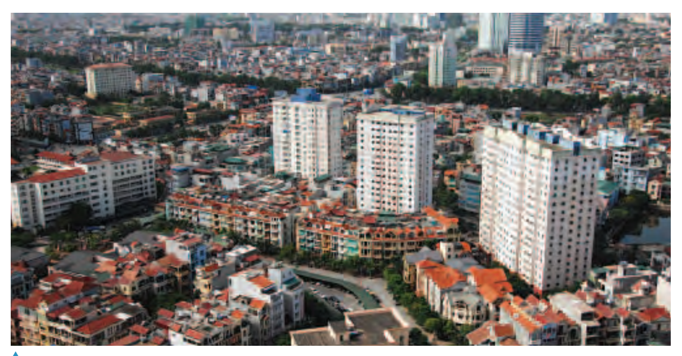
A planned area on the outskirts of Hanoi, Viet Nam.